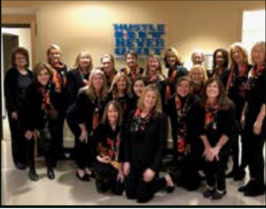
Above : The Junior League of Atlanta's choral group, the Peach Pipes, lifted the spirits of patients and staff with their beautiful music.